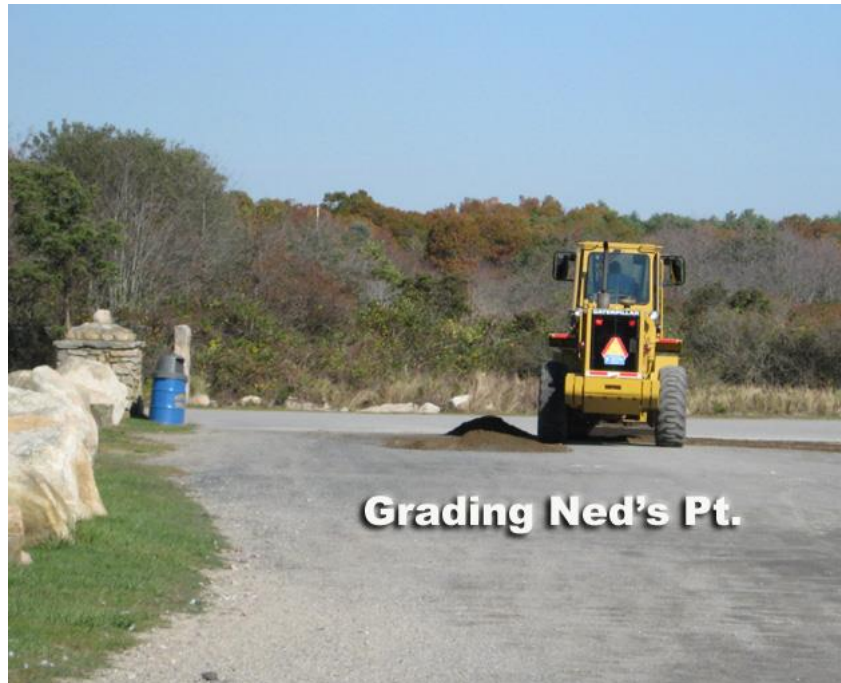
Grading Ned's Pt.