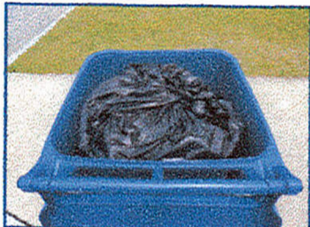
Place bagged trash in the cart with the blue lid.