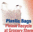
Plastic Bags Please Recycle at Grocery Store