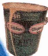
Dried Out Latex Paint