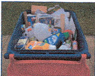
Place loose bottles, cans, paper, and cardboard in the cart with the orange lid.

THIS PROGRAM WILL BE MONITORED FOR COMPLIANCE.