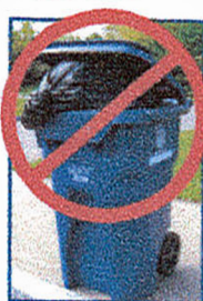
Please do not overfill carts. Lids must be fully closed.