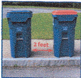
Proper cart setout.