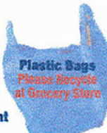
Plastic Bags Please Recycle at Grocery Store