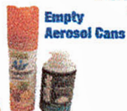
Empty Aerosol Cans