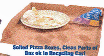
Soiled Pizza Boxes, Clean Parts of Box ok in Recycling Cart