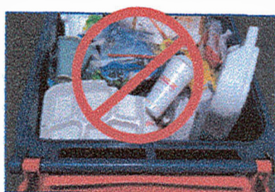
Please do not place non-recyclable items in the recycling cart including plastic bags and styrofoam.